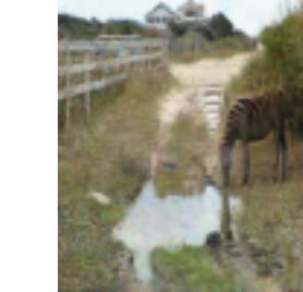
Q_{12}(w, f) \rightarrow P_{0.5}(w, f)