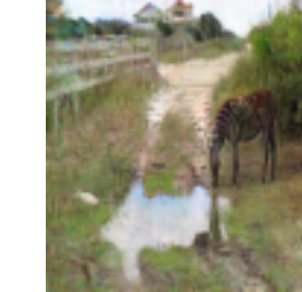
P_{0.5}(w, f) \rightarrow Q_{12}(w, f)