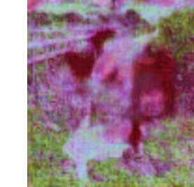
P_{0.5}(w) \rightarrow Q_8(w, f)